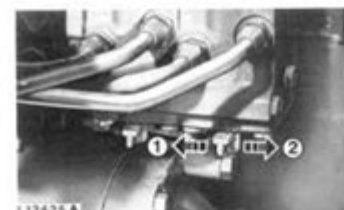
1—Slow Extend 2—Fast Extend

IMPORTANT: Full extension or retraction of a 2.5 in. (63.5 mm) dia. x 8 in. (203 mm) remote cylinder should require at least 1-1/2 to 2 seconds. Faster speeds may cause damage.