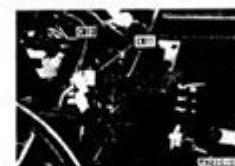
CN35, CN204 (male)